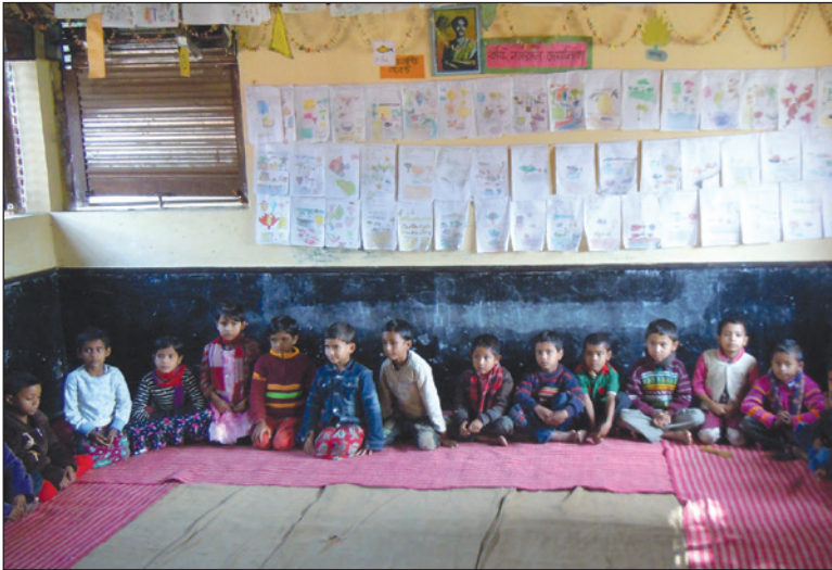
Inside of a preschool classroom in a rural area – Bangladesh

There is no better stimulation than from the mother! – Bolivia