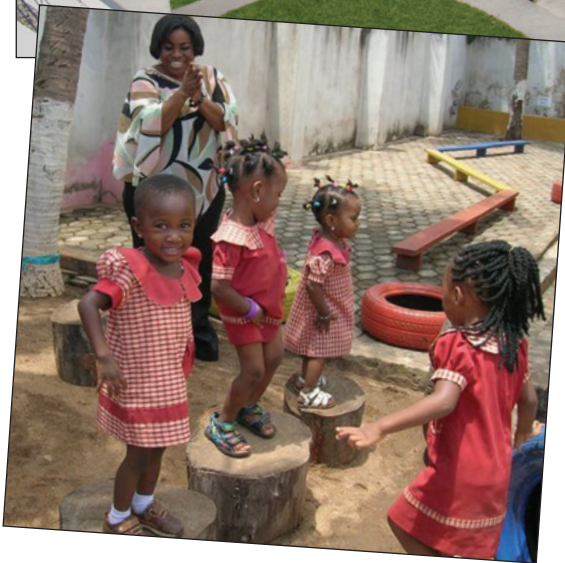
This model program in Ghana emphasizes use of found materials to create spaces for play and learning.