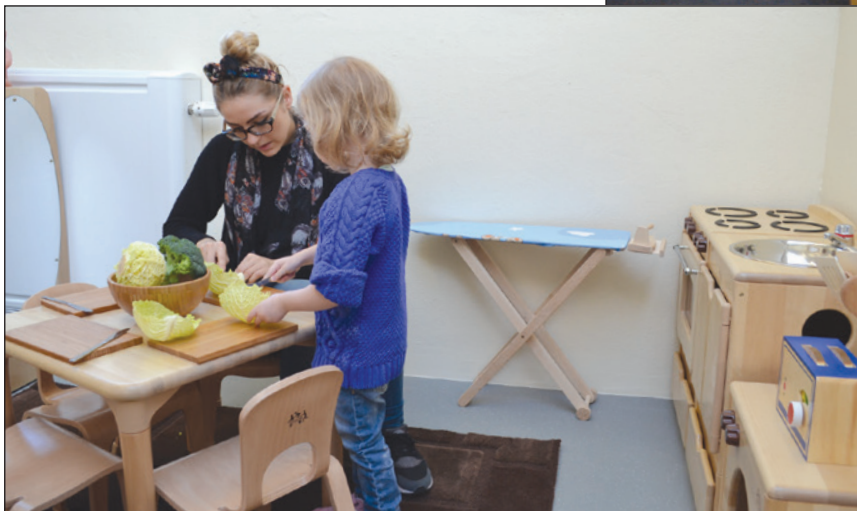
At London Early Years Foundation, we use real fruit and vegetables in our role play areas.