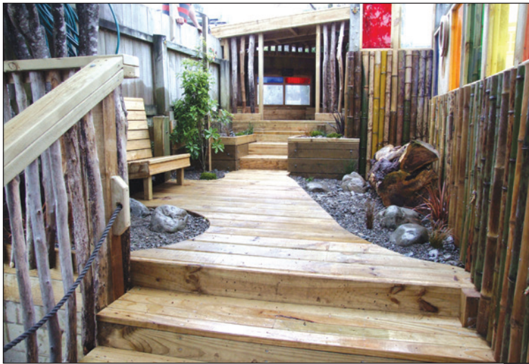
Childspace – New Zealand