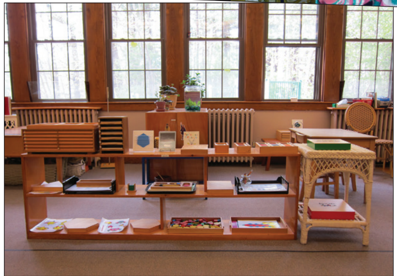
Pine Grove School, Falmouth, Maine – United States