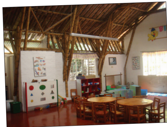
A children's room in an early childhood program. The structure is built from "Guadua," a big bamboo that we grow in Colombia. It has many attributes: being earthquake resistant, economical, beautiful, and very, very versatile. – Colombia

See more spaces for children from around the world and contribute your own! worldforumfoundation.org/gallery-inspiring-spaces