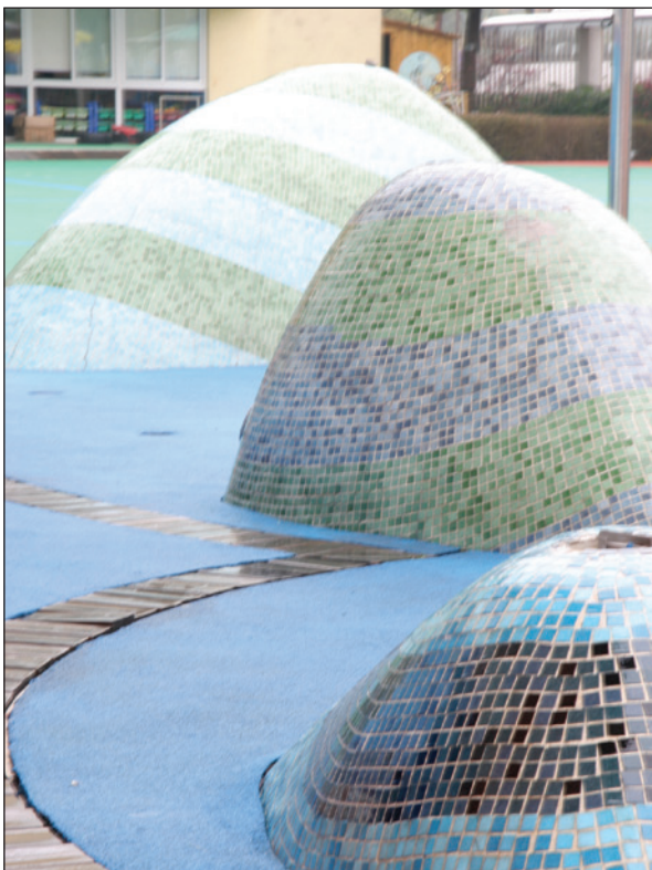
Xin Zhou – Suzhou, China